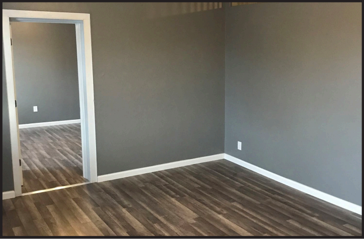
PHOTOS OF APARTMENTS A AND B WERE TAKEN PRIOR TO CURRENT TENANTS MOVING IN